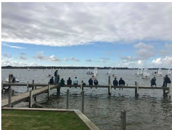
Figure 1 up close and watchful parents

Over the June long weekend Goolwa Aquatic Club hosted a combined SA State Championship and the ever popular Frostbite Regatta with a total of 62 sailors across 4 divisions. Who needs an excuse to sit with a water front view whilst watching the young sailors go by? 8 Optimist sailors came across from Victoria representing Royal Geelong YC, Sandringham YC and the Royal Brighton YC.