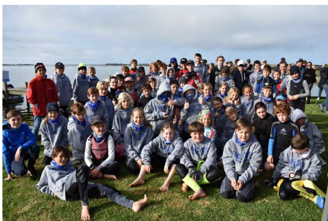
Figure 2 OPTI CLAN

Congratulations to the GAC team on putting on a great event. They have raised the bar yet again as this event goes from strength to strength. We