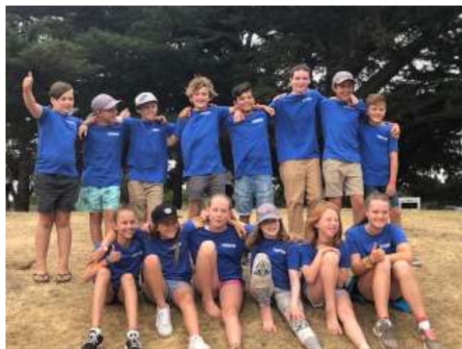
Team South Australia